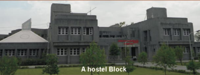
A hostel Block